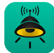
WiSpeak grip app