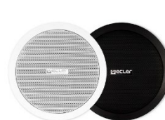
IC6 / IC8